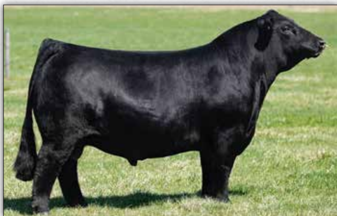
WLE BLACK MAMBA G203 - Sire of Lot 46