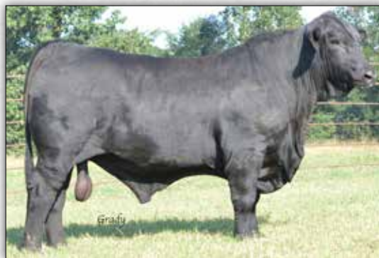
SCC ROBERTS PASSPORT 409U3 - Sire of Lot 23