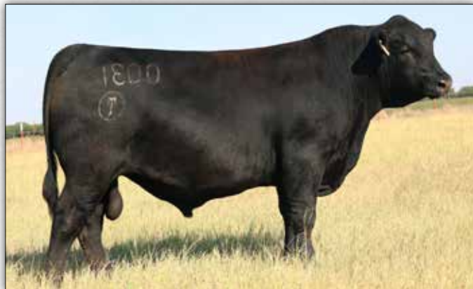
TAR Dominance 0031 - Sire of Lot 20