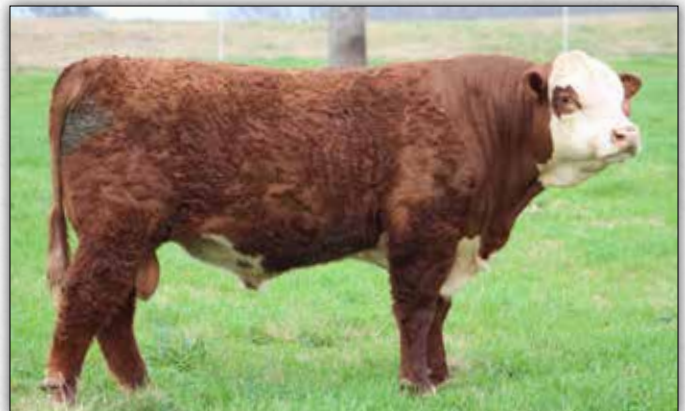
MSU GOLD RUSH L095 - Lot 35

MSU Gold Rush L095 is a dark red double goggled Polled Hereford that has very little white on his neck and body and will fit perfectly into a commercial or registered herd. He is moderate framed, has a long thick top, and has an excellent set of feet and legs. If you are looking to increase carcass weight and quality, this is the bull for you, with MCW (5%), CW (22%), Marb (4%) and CHB (9%). Parentage verified with GE-EPDs. Consigned by: Mississippi State University