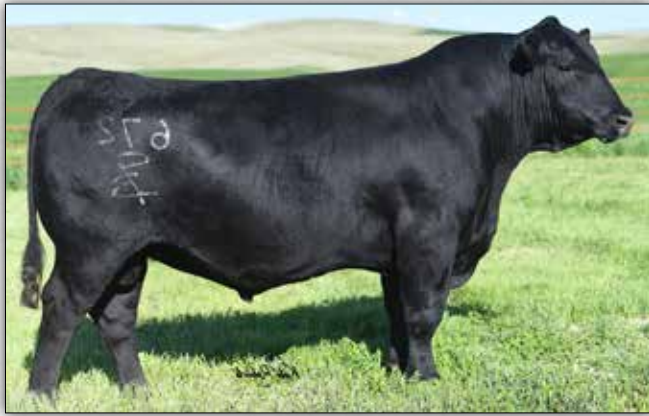
GB Fireball 672 - Sire of Lot 14