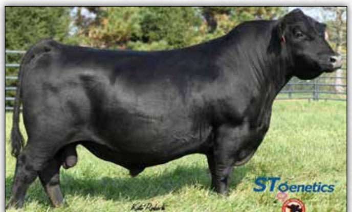
Poss Rawhide - Grandsire of Lots 1- 4 and Sire of Lot 5

3558 is a calving ease Poss Ratified son out of a GAR Kansas daughter. He combines strong production, maternal, and carcass values, with 11 EPDs in the top 10% of the breed. Additionally, he ranks in the top 3% for $B and $C, making him a well-rounded sire for improving both profitability and genetic merit in your herd. Consigned by: Fairway Farms