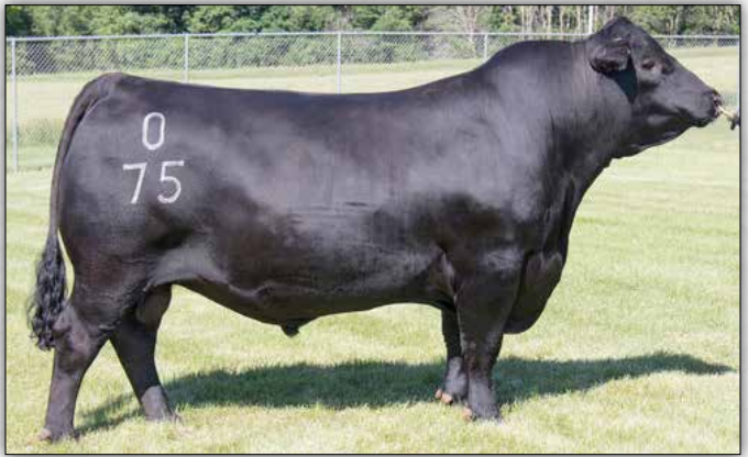
LAR Man In Black - Sire of Lot 19

A son of the popular Tehama Patriarch leading back to Traveler 004, L37 has the genetics and calving ease perfect for a set of heifers. L37 has a well-balanced phenotype and EPD's making him an adaptable herd sire! Consigned by: Fulper Farms