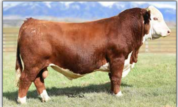
NJW Long Haul 36E ET - Sire of Lot 33

Here is a young bull that we don't usually offer at this sale. His performance and color are sure to add to your operation. He's one to add as your herd sire if you are looking for a horned, calving ease bull that will add color. Consigned by: Bonebrake Herefords