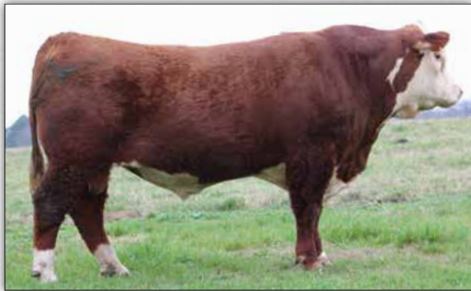
MSU GOLD RUSH L081 - Lot 36