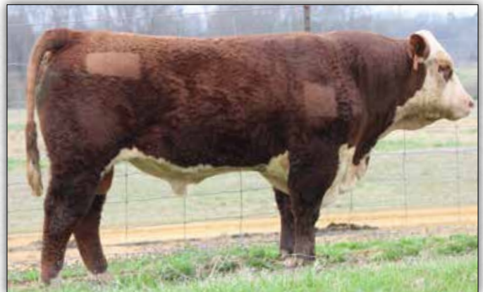
MSU GOLD RUSH L096 - Lot 34

MSU Gold Rush L096 is a polled powerhouse. He has a strong thick top, a thick deep rump, pigmentation on both eyes, and that dark mahogany red that everyone is looking for. He stands on an excellent set of feet and legs and has been a standout since birth in our Polled Hereford herd. We think so much of him, that we are using him as our pasture cleanup bull for our Fall calving herd. With 11 EPDs and Indexes ranking in the Top 25%, you are definitely going to want to take a look at him on sale day. Parentage verified with GE-EPDs Consigned by: Mississippi State University