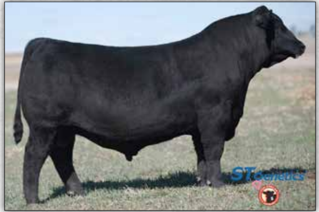
Kenny Rogers - Sire of Lots 7 - 11