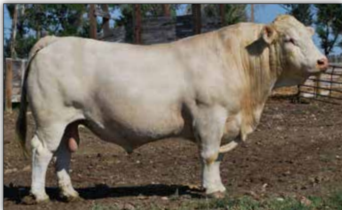
CJC MR PRESIDENT T122 - Sire of Lot 29