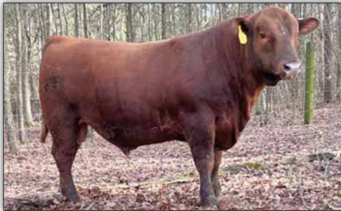
OSBORN PLATINUM 603L - Lot 39

39 OSBORN PLATINUM 603L Birth Date: 09-04-2023 Bull 4888468 Tattoo: 603L