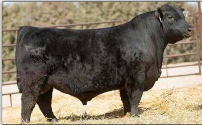
Poss Ratified - Sire of Lots 1 - 4