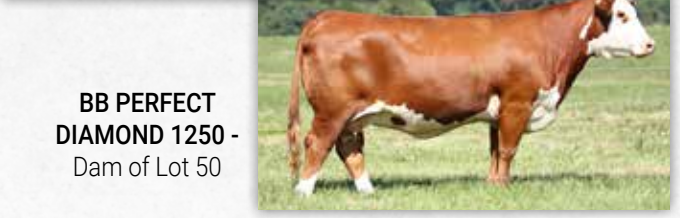
BB PERFECT DIAMOND 1250 - Dam of Lot 50