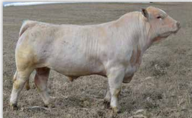
K&D PROFESSOR - Sire of Lots 43 & 44