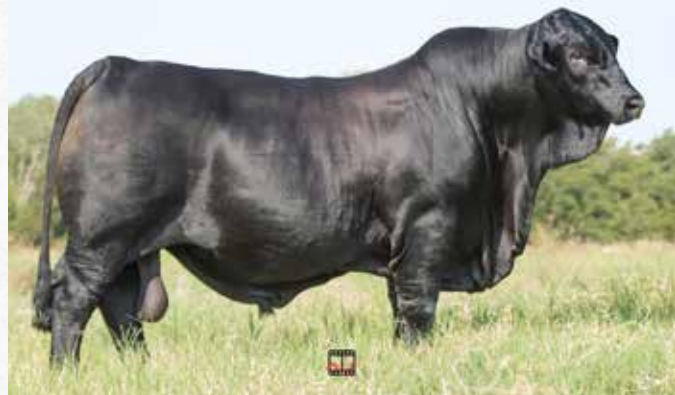
NEVER SURRENDER OF SALACOA 803D9 - Sire of Lots 34 & 35

Three D son out of Coronado daughter. Calving ease with Growth. Top 12% CED; 30% BW; 35% WW.