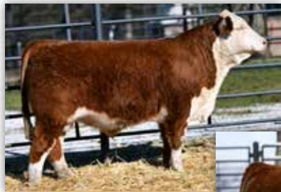
OBCC CATAPULT T20H ET - Lot 53