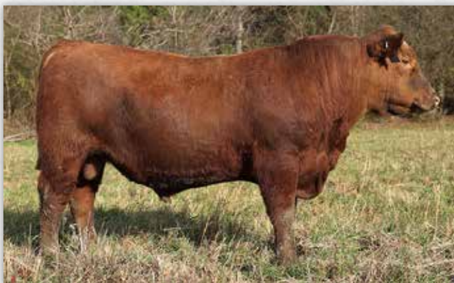
DIX BOURNE 347G - Lot 59

Sired by Maximum. Top 10% Milk. Look at that spread - 60 lbs BW and 606 lbs WW.