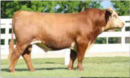
ECR HW 215 DOMINO 6001 - Sire of Lot 48

Long-bodied bull with plenty of growth. The best yearling weight of the Spring yearlings. Great EPD spread. Outstanding Growth and Maternal.