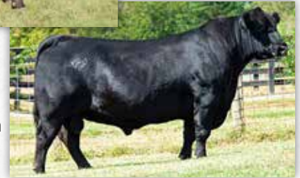
Whitestone 18-Million - Sire of Lots 4 & 5