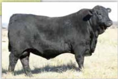
SF BRICKHOUSE 909D9 - Sire of Lots 28 & 29