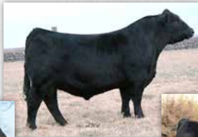
W/C EXECUTIVE ORDER 8543B - Sire of Lot 71