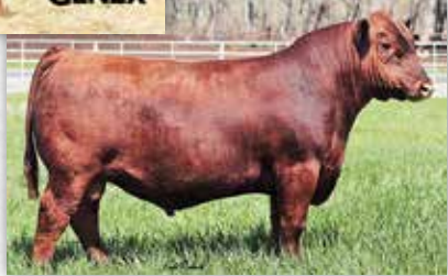
LSF MEW PLATINUM 5660C - Sire of Lot 64