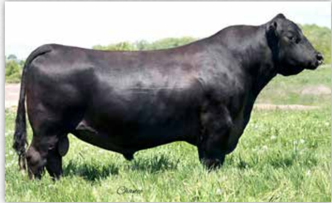
Jindra Acclaim - Sire of Lots 18-20