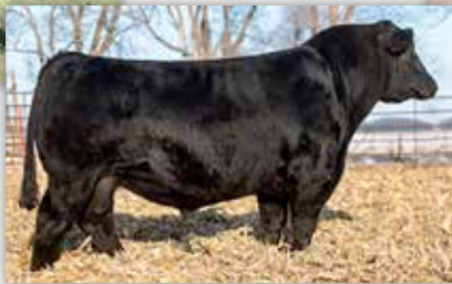
W/C DOUBLE DOWN 5014E - Sire of Lots 69 & 74