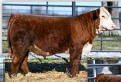
OBCC ROCK C08H ET - Lot 55