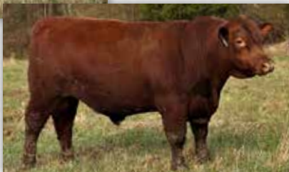
DIX BOURNE READY 346G - Lot 58