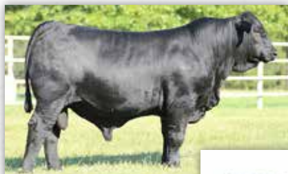
DMR ELDORADO 30B15 - Sire of Lots 23 & 24