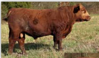
DIX BOURNE SILVER 343G - Lot 57

Bourne Silver son out of the Dutchess family on the bottom. Outstanding Growth and Production. Top 7% WW & YW; 22% ProS & HBDIX. BOURNE READY.