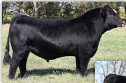
MR CCF 20-20 - Sire of Lot 68