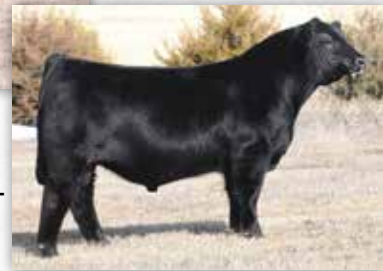
W/C RELENTLESS 32C - Sire of Lots 72 & 73