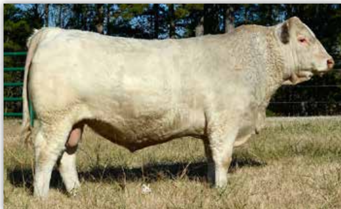
SAT SUNDANCE 5113 P ET - Sire of Lot 41