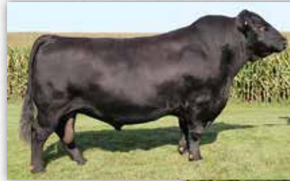
Mill Bar Hickok 7242 - Sire of Lot 3