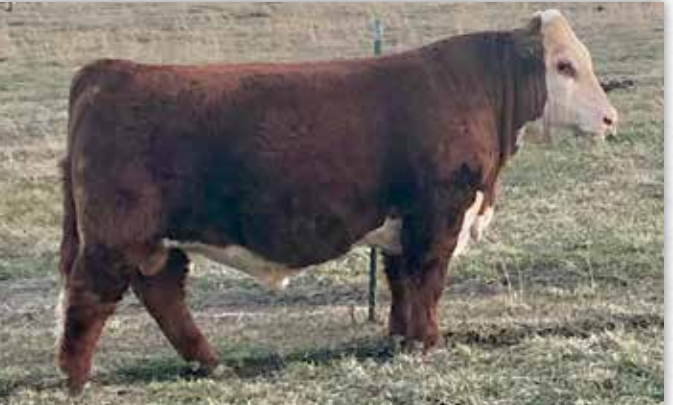
BB 6153 FIRST DRAFT 128G - Lot 49

Here is a horned bull with plenty of pigment around his eyes. Above breed average on 90% of his EPDs.