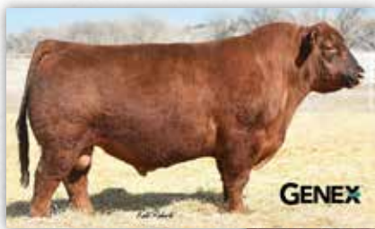
3SCC DOMAIN A163 - Sire of Lot 63